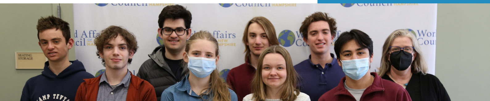
Portsmouth High School's Academic WorldQuest teams join together prior to the competition, held on March 15, 2022. This was the first in-person competition held since March of 2019.