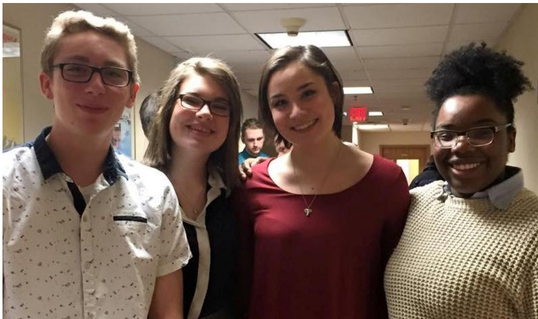
Above: Students from Manchester West STEAM competed in the 2nd annual NH Academic WorldQuest competition in March 2016, held at SNHU. Front cover: Young conservationists from around the world visited New Hampshire's Seacoast for a program called, "Our Oceans are Your Oceans;" Front, bottom: The team from Oyster River High prepared for the next question at NH AWQ.